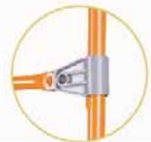
Resin Fixing Part B for Hanging Rod