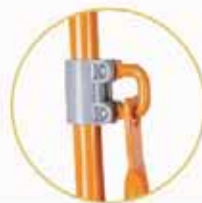
Resin Fixing Part A for Hanging Rod