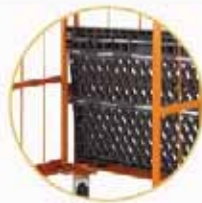
plastic pallet bottom