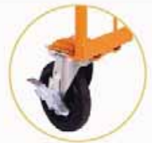
swivel caster with brake