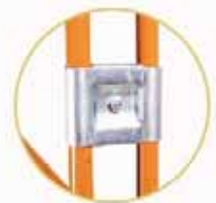
Clamping piece galvanized externally