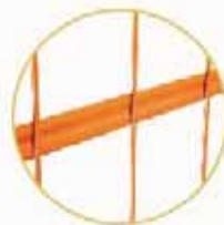
Lightweight reinforcing rib, more solid