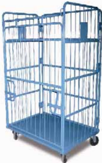
Trolley with Front Hanging Door

Suitable for the storage and distribution of cold drink and other low-temperature food