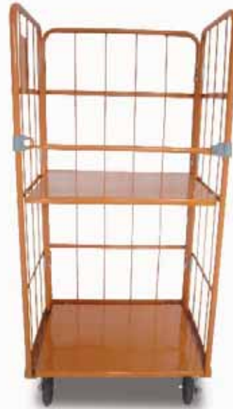
roll cage with steel plate level

Suitable for storage and transportation of lightweight, box-packaged goods