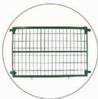
mesh panel level