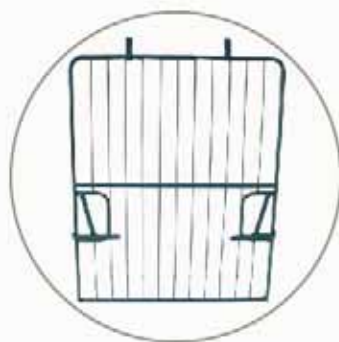
Front Hanging Door