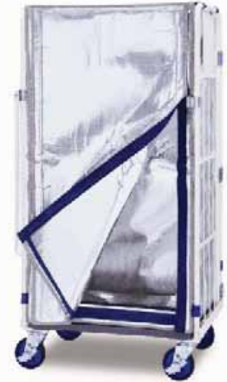
roll cage for frozen insulation

Applicable to the storage and transportation of classified products and products which can not be pressed