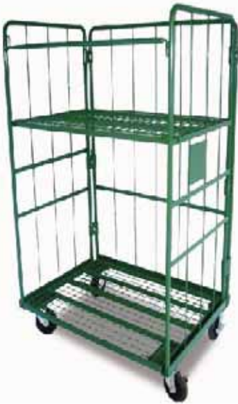
roll cage with mesh panel at the bottom

Suitable for storage and transportation of lightweight, box-packaged goods