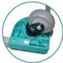
back of plastic connecting part TPR Caster