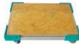
with wood plate