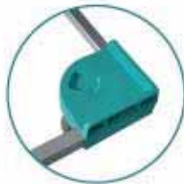
plastic connecting surface (flat surface is also for you)